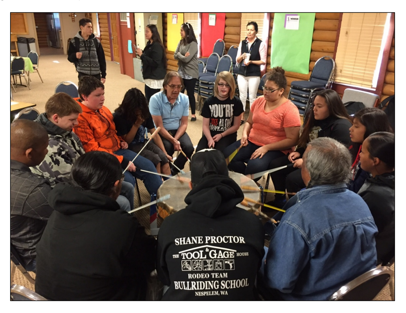
Elder/Student Drumming Group