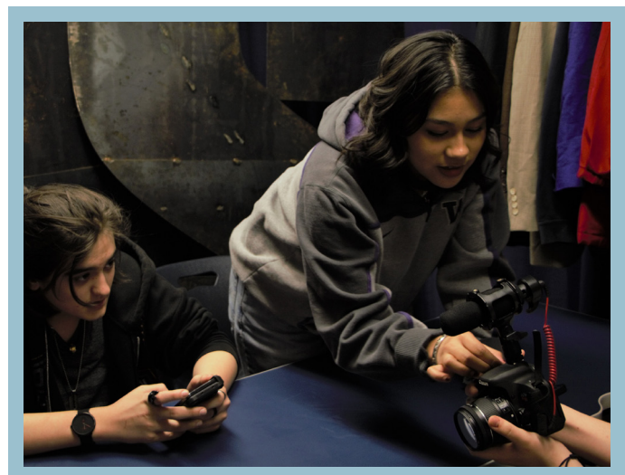
Gov. John R. Rogers High School, Puyallup

School districts must adopt a local policy that meets state requirements before offering the performance-based pathway option. Most school districts that are interested in offering this pathway will be able to offer it beginning with the Class of 2025. Some districts that have already laid groundwork may be able to begin with the Class of 2024. For example, districts that are already doing mastery-based learning and districts that have a local culminating project requirement may be able to develop this new pathway faster.