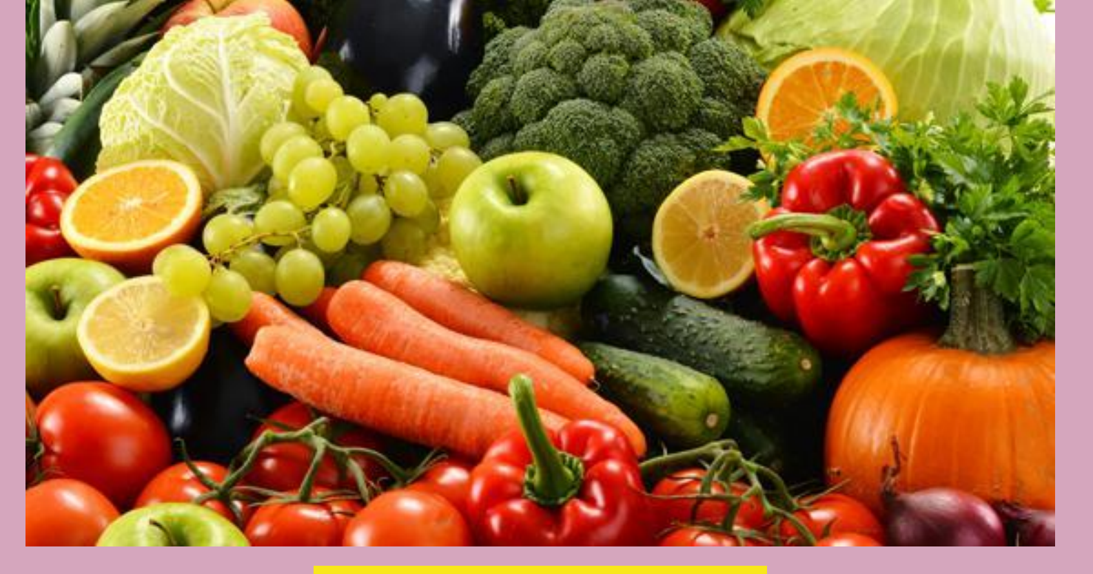
Food and Nutrition